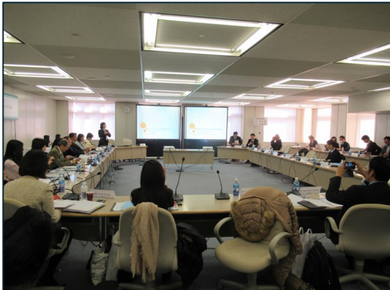
Meeting at the TMG Building